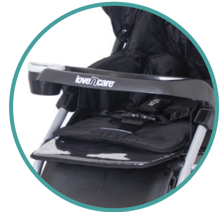
Removable food tray