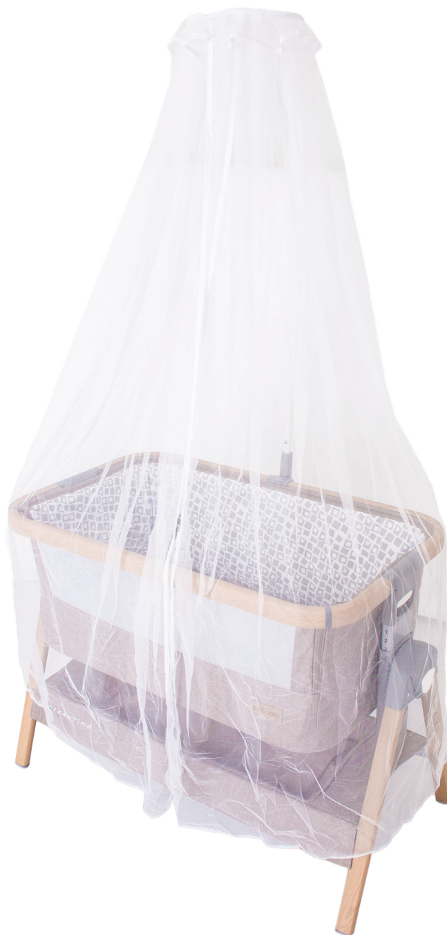
Halo net and stand on Dreamtime